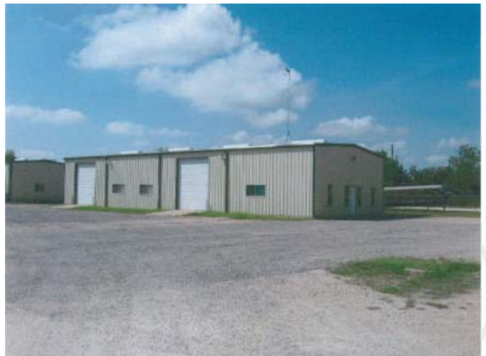
Office/Warehouse 4: 4,000 SF