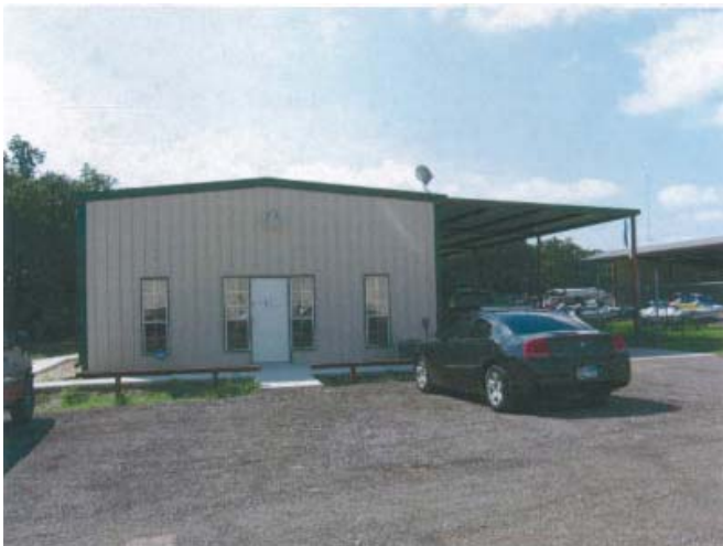
Office/Warehouse 7: 3,000 SF