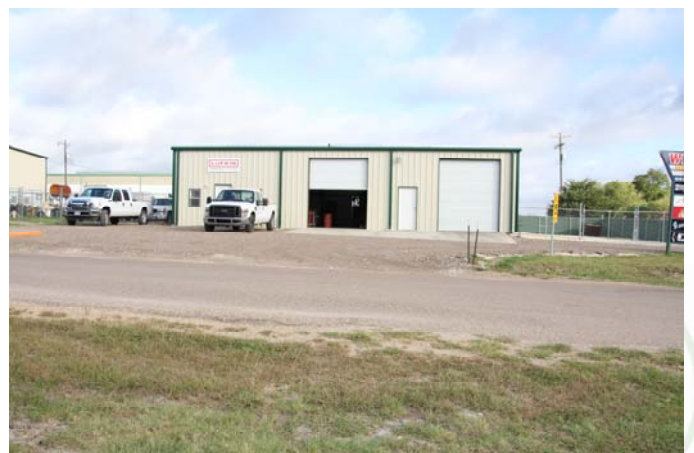
Office/Warehouse 8: 3,000 SF