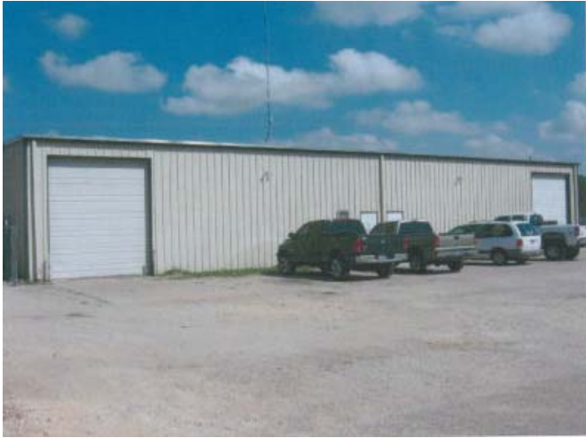
Office/Warehouse 1: 4,000 SF