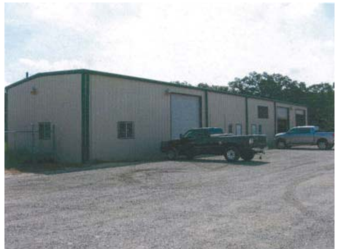
Office/Warehouse 6: 3,600 SF