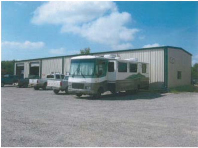
Office/Warehouse 5: 3,600 SF