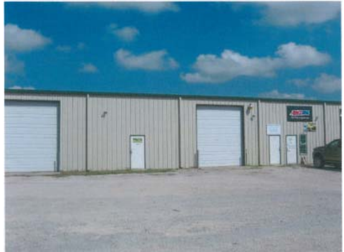
Office/Warehouse 2: 4,000 SF