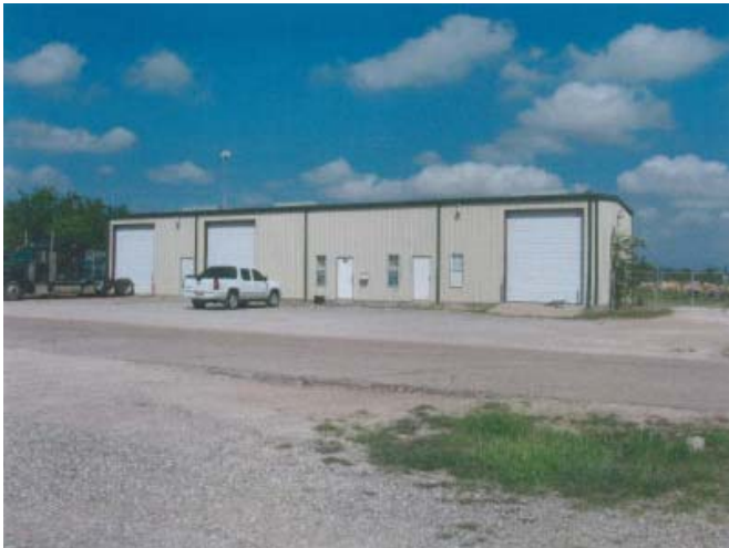
Office/Warehouse 3: 3,300 SF